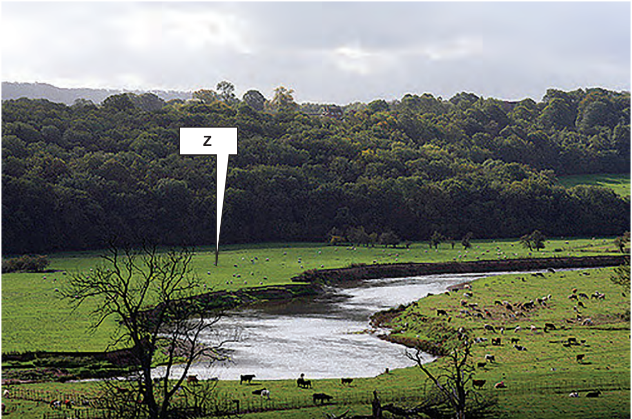
Fig. 2 – Photograph of the River Severn